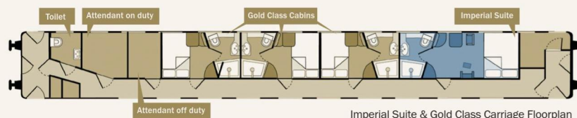
Imperial Suite & Gold Class Carriage Floorplan